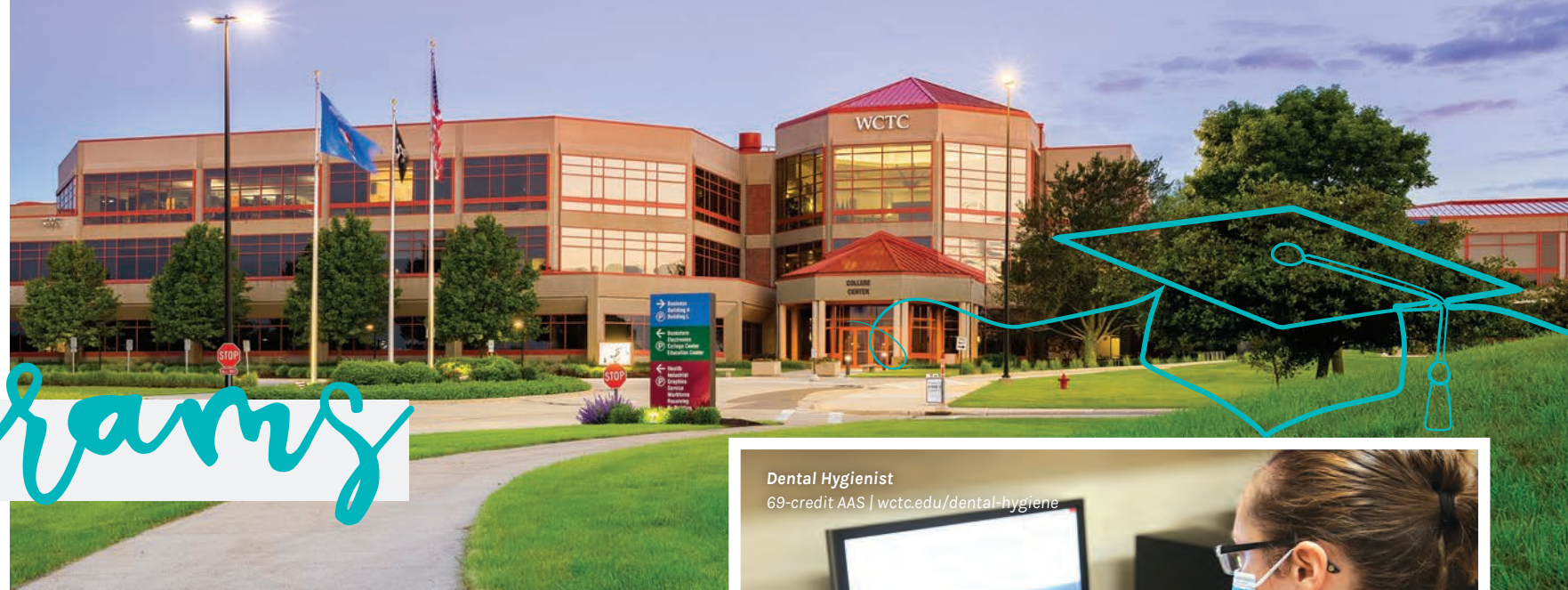
Dental Hygienist 69-credit AAS | wctc.edu/dental-hygiene

Automation Systems Technology (Robotics) CNC Setup Technician Electrical and Instrumentation Industrial Electrician Industrial Maintenance Technician Injection Mold Setup (Plastic) Machine Tool Operation Machinist