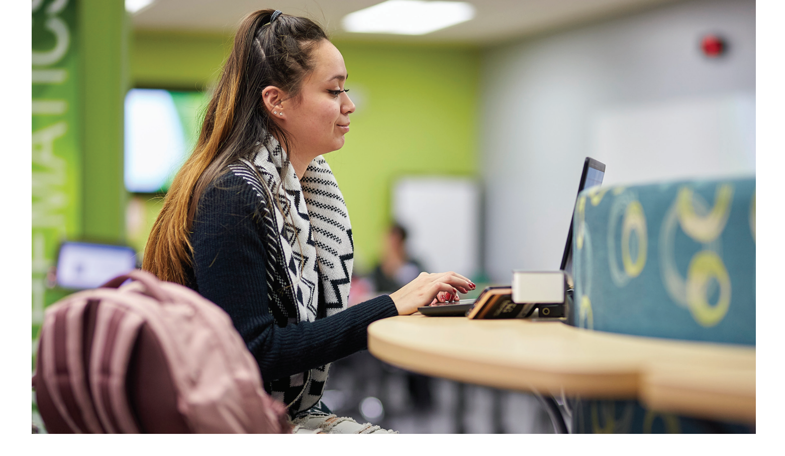
The WCTC Foundation provides support for students to access, continue and complete their educational journey at WCTC.