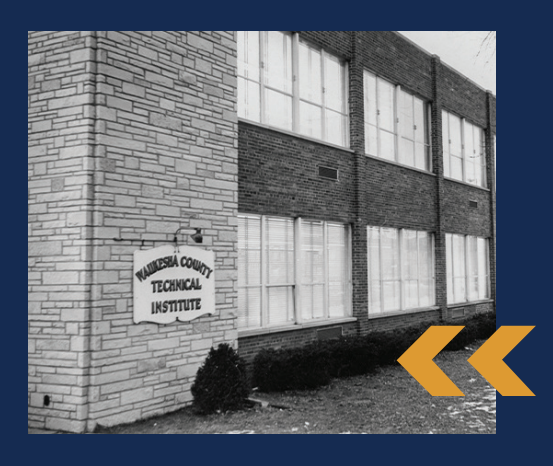
WCTC's Maple Street location in 1956.